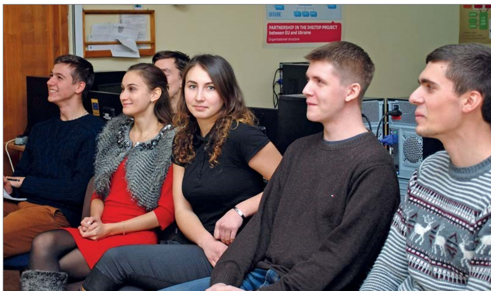
International R&D and Start-Up School Workshop